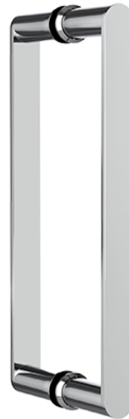
Double Door Handle shown with a small Rosette